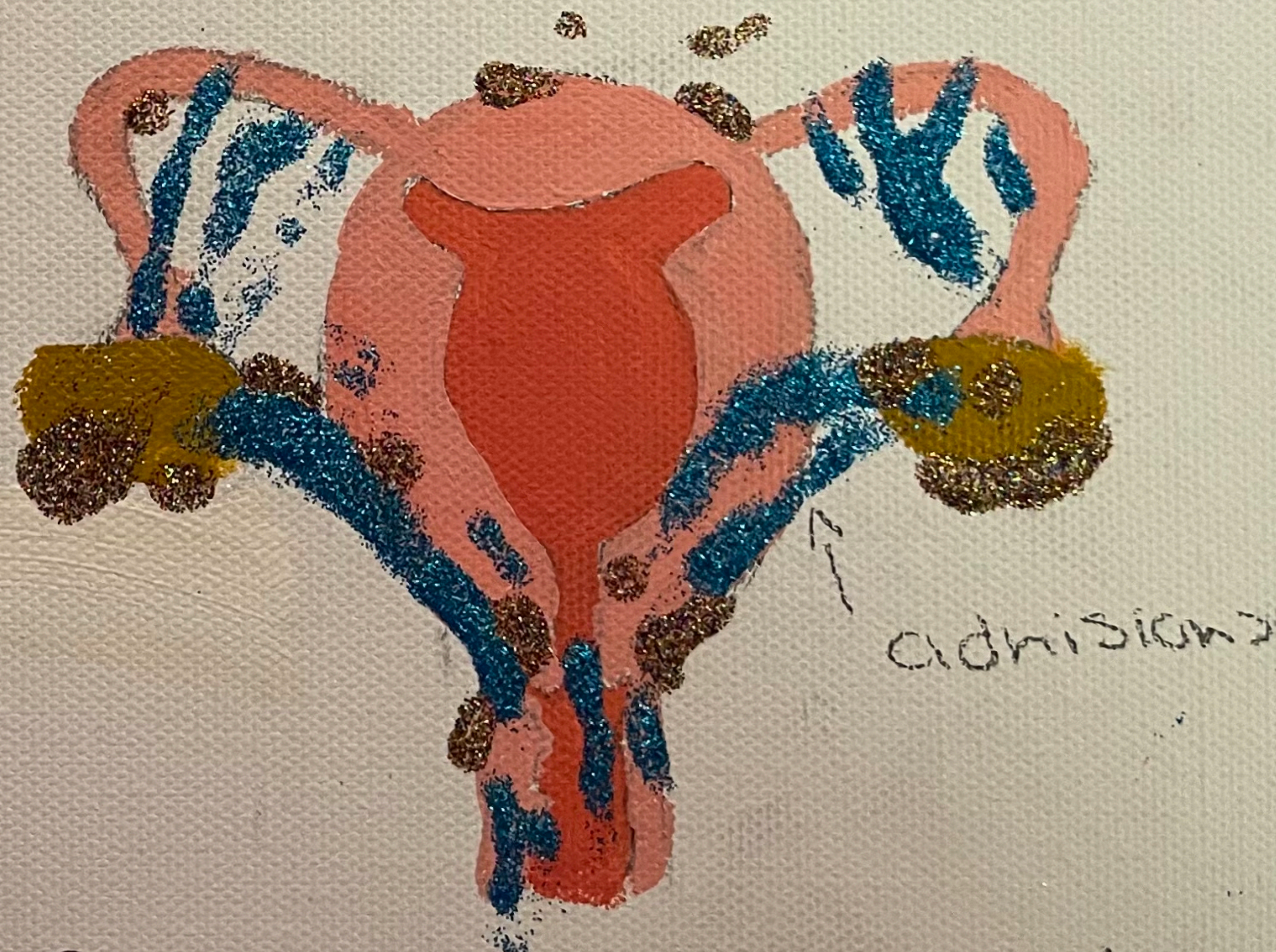
Stage 4 (severe)