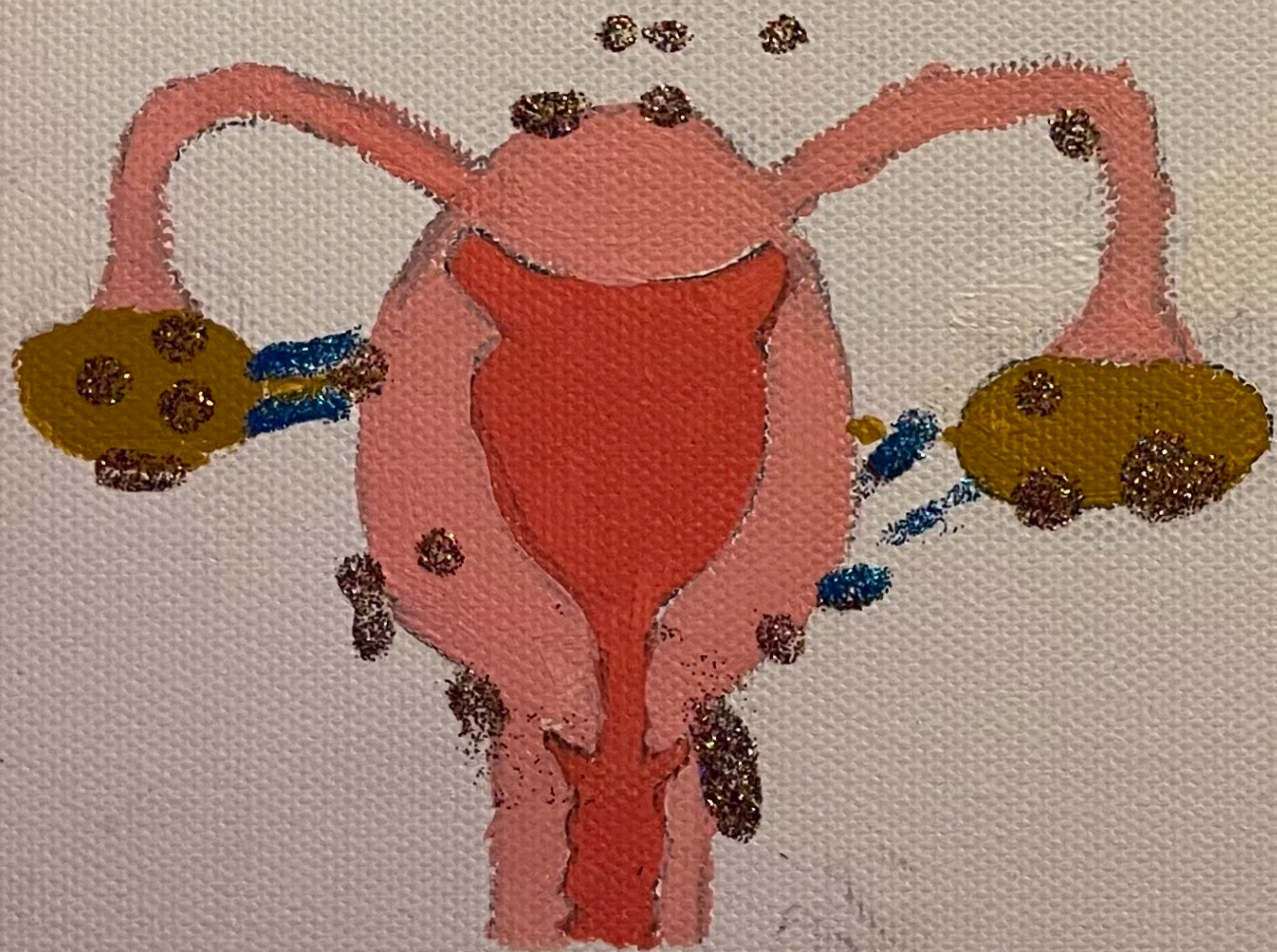
Stage 3 (moderate)